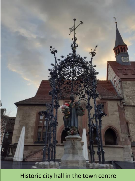
Historic city hall in the town centre

The aim of the conference is to be as sustainable as possible. Various measures are planned to avoid general and food waste as much as possible, including: