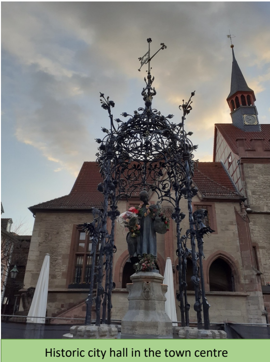
Historic city hall in the town centre

The aim of the conference is to be as sustainable as possible. Various measures are planned to avoid general and food waste as much as possible, including: